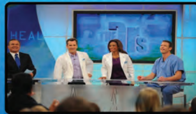
The ML830® Laser was featured on CBS, "The Doctors"